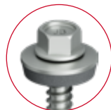
Self-drilling screw JT3-2H-plus-5.5